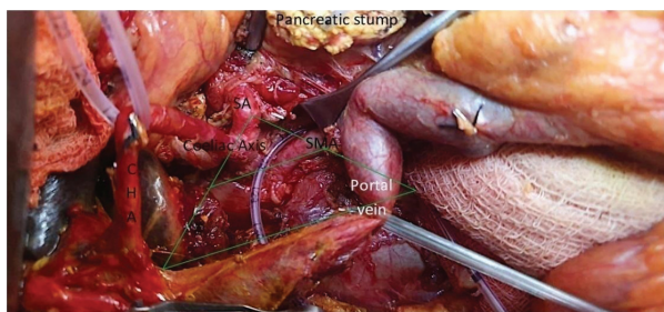
Figure 3: After clearance of apical tissue around Superior Mesenteric artery (SMA) and Coeliac axis(CA). CHA: Common hepatic artery; SA: Splenic artery; SMA: Superior mesenteric artery.