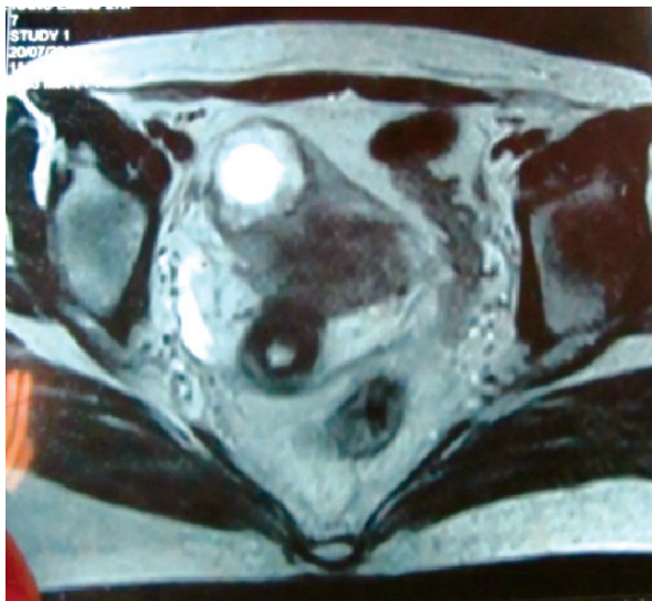
Figure 2: MRI pelvis of the patient.