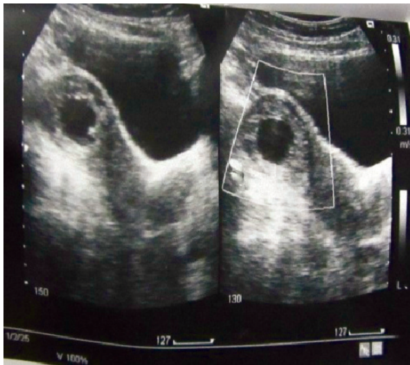
Figure 1: Pelvic ultrasonography of the patient

Hospital on 21 st July 2013 with complain of amenorrhoea for 9 weeks with intermittent per vaginal bleeding, moderate in amount since 1 month. On examination patient was conscious and her blood pressure, pulse, respiratory rate and SPO2 were within normal limit. On abdomino-pelvic examination, uterus was six weeks size with slight right adnexal tenderness was present. No guarding or rebound tenderness was noted. Obstetrical ultrasound revealed thick hyper echoic wall with cystic area in centre measuring 16.3 mm in the right cornua of the uterus without embryo or yolk sac, consistent with 5 weeks 1 day pregnancy (Figure 1). MRI done also revealed the same findings as of Ultrasound (Figure 2). No free fluid was noted at the cul-de-sac. The patient was diagnosed to have unruptured interstitial pregnancy and admitted.